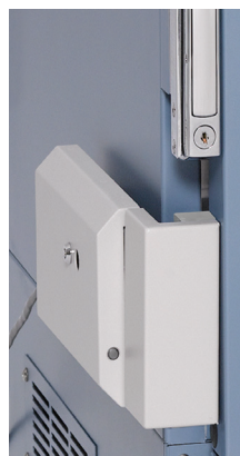
Undercounter Adapter (Shown with Omnicell® FlexLock)