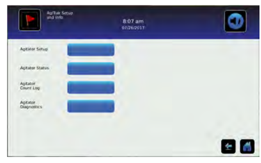
AgiTrak Setup and Info screen

Select the AgiTrak icon to open the AgiTrak Setup and Info screen. Enter the agitator information to allow monitoring and control of the device.