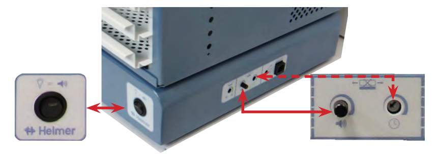
Motion alarm switch.