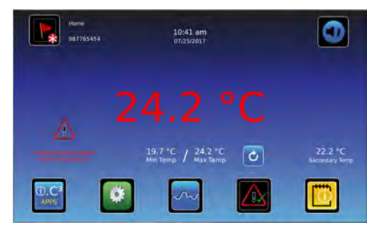
Home screen with active alarm

Active alarms are displayed on the Home screen. Refer to Appendix A for a list of potential active alarms.