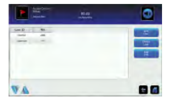
Access Control Setup password screen