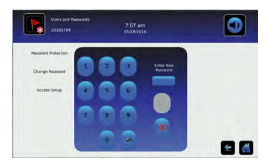
Change Password keypad