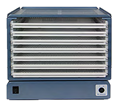
Table 2. Agitator Capacity