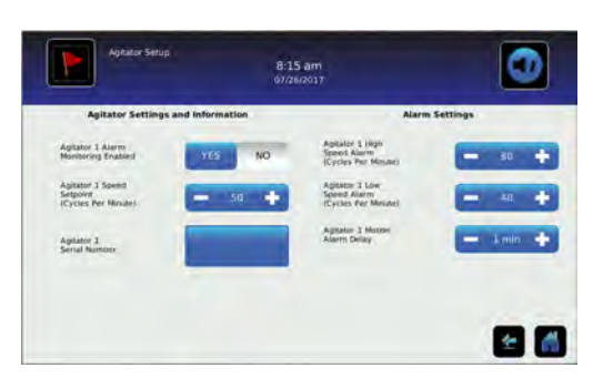
Agitator Setup screen