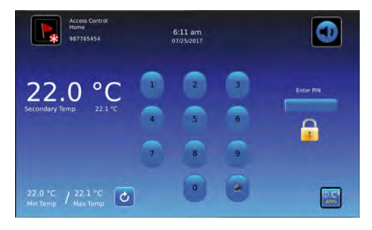
Access Control Home screen