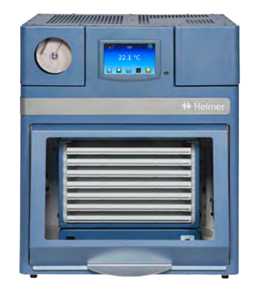
Table 3. Agitator Capacity