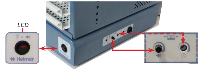
Motion alarm switch.