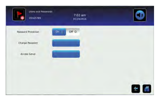
Users and Passwords screen

> Enter settings password. Select Users and Passwords.