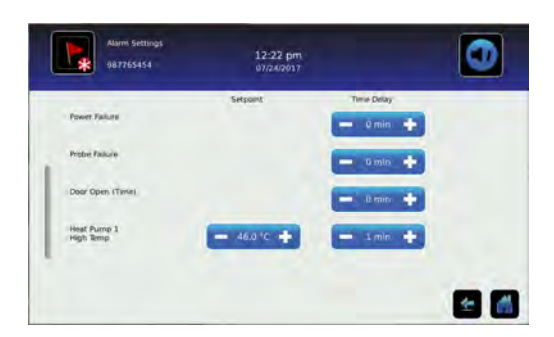
Alarm Settings screens

Alarm settings control the circumstances and timing of alarm condition indicators displayed on the i.C3 Home screen.