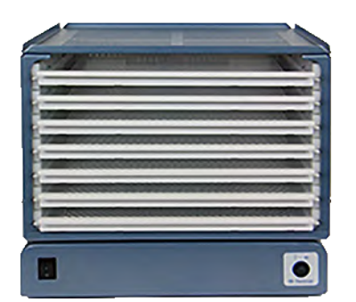
Table 2. Agitator Capacity