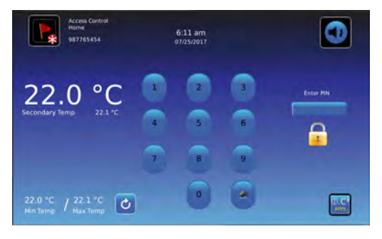
Access Control Home screen