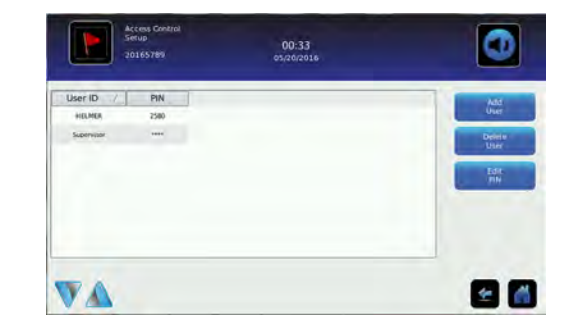
Access Control Setup password screen