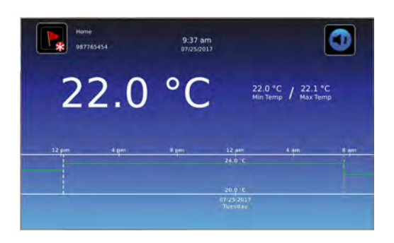
Home screensaver (touch to return to Home screen)