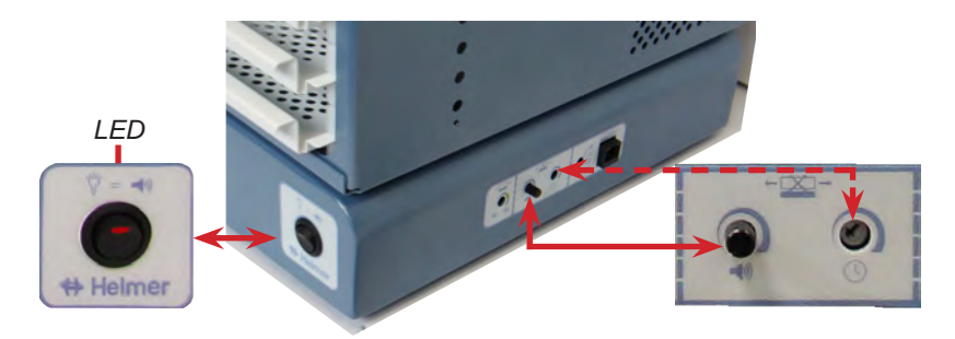
Motion alarm switch.