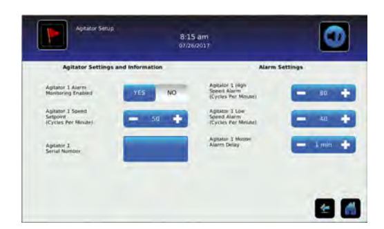
AgiTrak Setup and Info screen