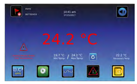
Home screen with active alarm

Active alarms are displayed on the Home screen. Refer to Appendix A for a list of potential active alarms.