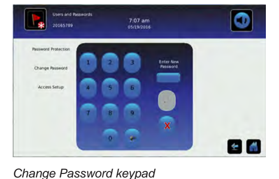
Users and Passwords screen