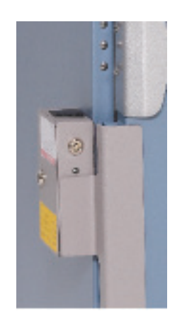
Undercounter Adapter* (Shown with Pyxis® Lock)

*Confirm dimensions of your Pyxis lock prior to placing order