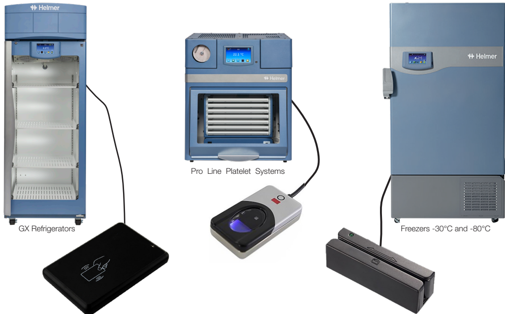
Possible Customer-provided Access Management Devices

Control integrated exterior door locks on Helmer equipment with your existing 3rd party device