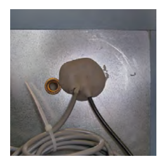
Left: Probe bottle with temperature probe. Right: Rear access port.