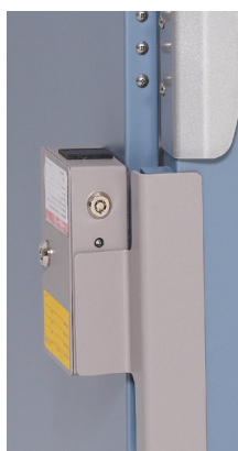
Undercounter Adapter (Shown with Pyxis® Lock)