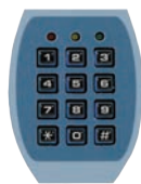
Horizon access keypad