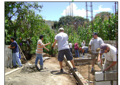
Guatemalan foreman assists Helmer team lay concrete blocks walls.

"Drug traffickers and gangs now control most of the country."