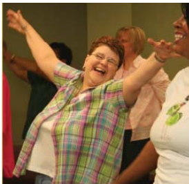
The breakout sessions were much fun!

On Saturday, May 1, Joy's House and Alliance Home Health Care hosted a wonderful day of celebration & education for caregivers. Attendees enjoyed visiting vendor booths from industry leaders and supporters, speaking with an attorney about legal concerns regarding the care of